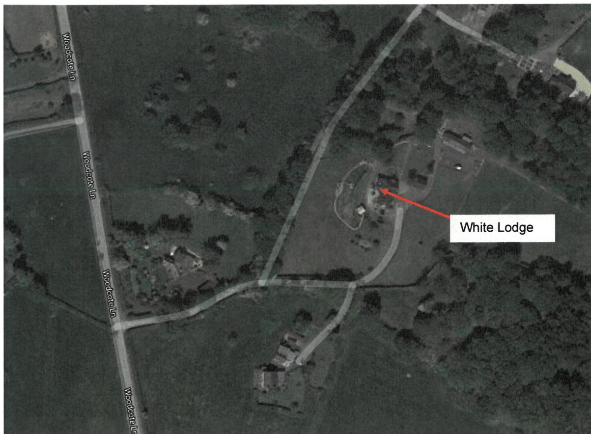
Figure 1 Location of the property.

1.4.1 White Lodge is located to the east side of Woodcote Lane (see figure 1), along an unmade track which serves several other properties.