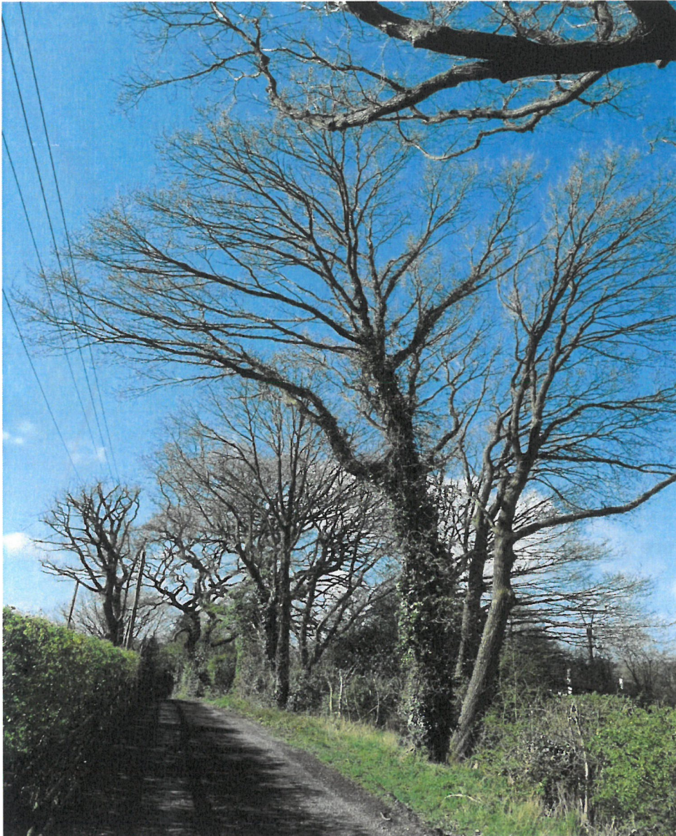
Figure 2 View of trees and hedges to the west side of White Lodge.

1.5.3 A number of trees along the lanes have recently been felled or pruned.